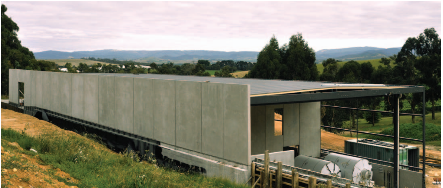
Medhurst Winery, photographed from the south-east angle, showing the main wall and what will be the vintage area. It was 6 weeks from completion and first vintage.

complete all refrigeration and insulation for the winery and JMA Engineering and A&G Engineering will complete and install all tanks, fermenters and associated infrastructure.